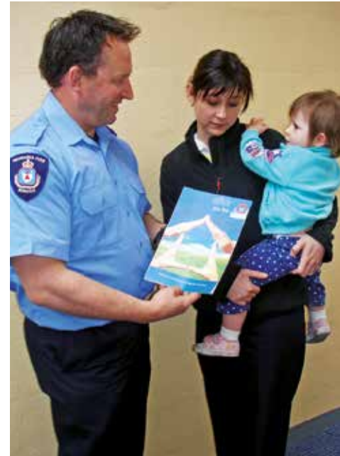
Emergency service officer contact details

community fire safety on freecall 1800 000 699