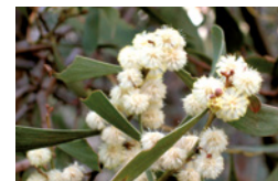
Acacia melanoxylon - Blackwood

These plants should be avoided in the Building Protection Zone. They should not be allowed to dominate your garden and should be well maintained, being especially careful to remove dead material before it accumulates.