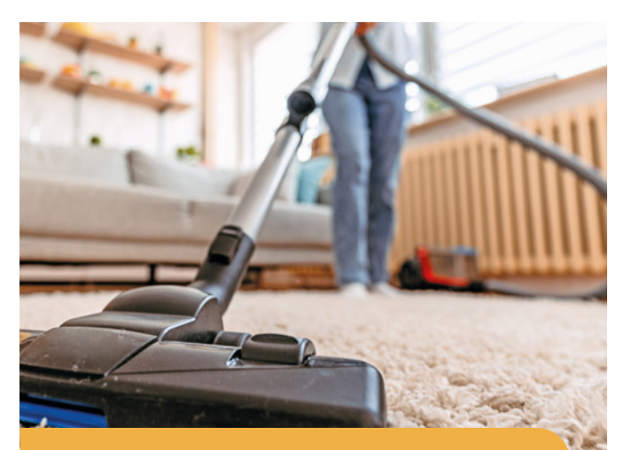
You can clean throw rugs by beating, sweeping or vacuuming and then shampooing.