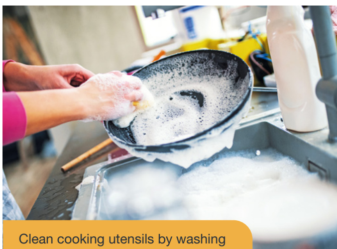
Clean cooking utensils by washing with soapy water, rinse and then polish with a fine powdered cleaner.

If the Tasmania Fire Service turned off your gas or power during the fire, call your electric or gas company to restore these services – do not attempt this yourself. Do not use appliances, particularly electrical appliances, that have been exposed to water until you have an authorised service technician check them.