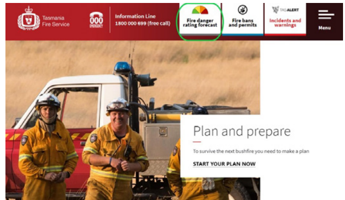
Check the fire danger rating forecast on the Tasmania Fire Service website www.fire.tas.gov.au