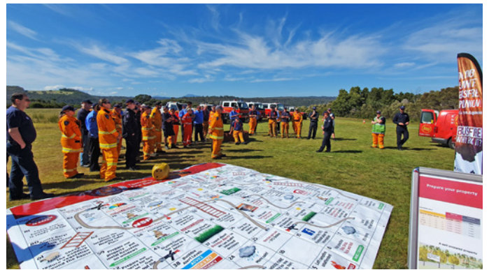
The famous Hoses and Ladders Game from Bushfire-Ready Neighbourhoods in foreground with gathered Volunteers taking the exercise briefing

Over 20 agency appliances were in attendance and over 50 volunteers from brigades from George Town, Weymouth, Pipers River, Pipers Brook, Lilydale, Karoola, Dilston, George