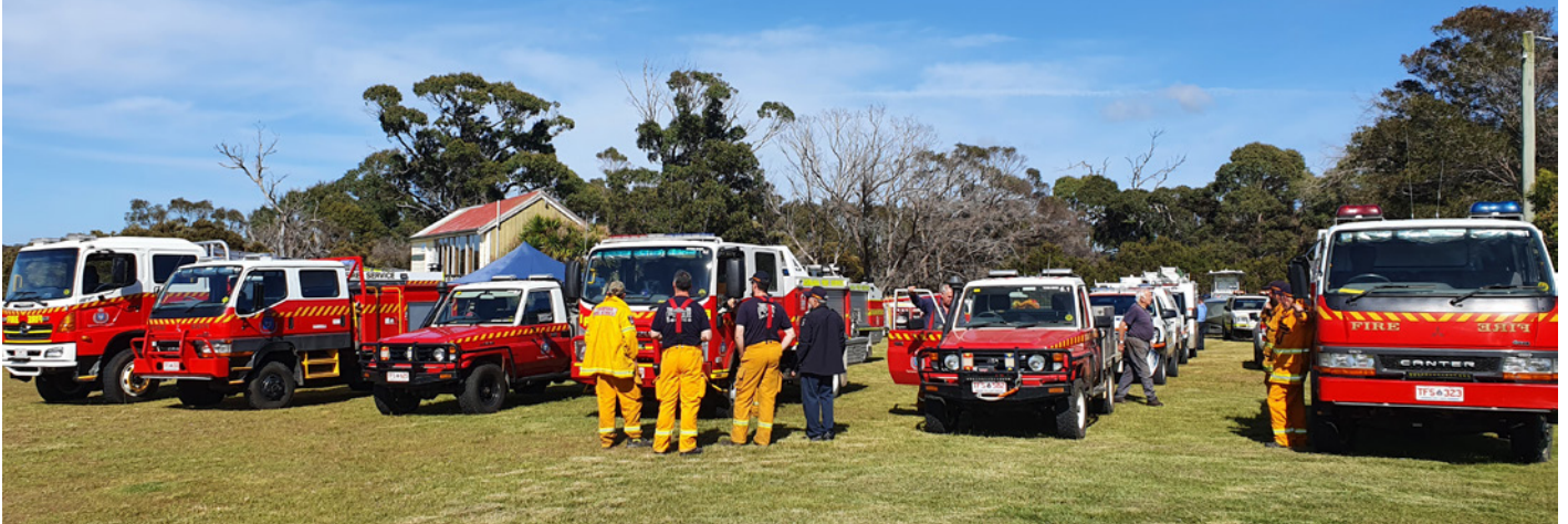
Some of the assembled TFS appliances